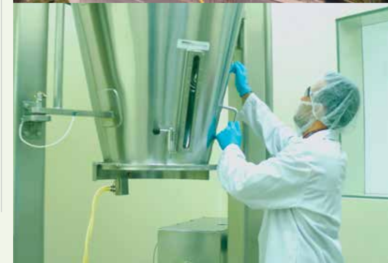
Top: INRS-Institut Armand-Frappier